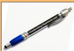
Superstyluscriptastic Pen TAS60101-4

Provides a soft surface or aids placement to support comfort and decrease fatigue during writing.