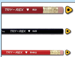
Try Rex Pencils TAS1103-5