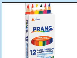
Prang Triangular Colored Pencils TAS33418