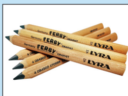
Ferry Beginner Triangular Pencil TAS32912

Positions fingers to promote a functional grasp pattern to help improve writing legibility and control.