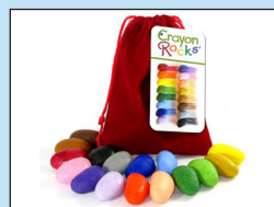
Crayon Rocks THS43502