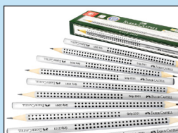
Jumbo Grip Triangular Pencil TAS1111