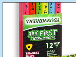
Ticonderoga My First Tri-Write Neon Pencil TAS33421