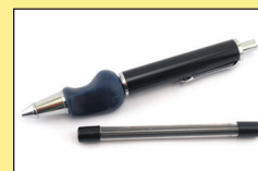
Weighted Mechanical Pencil TAS9347