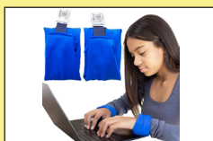
Go-Support Wrist Fidget THS440103

Increased Feedback These weighted products assist in increasing awareness of the fingers and hand.