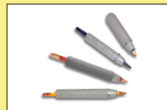
Weighted Holders TAS1901-4