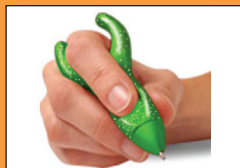
Twist 'N Write Pencil TAS33503