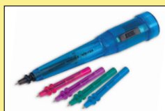
Squiggle Wiggle Writer Pen THC7401

Alerting These provide light touch sensations for alerting sensory input.