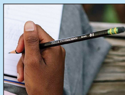
Ticonderoga Non-Slip Pencils TAS33411