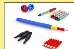
Tran-Quil Writing Kit THS0157