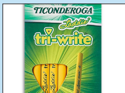
Tri-Write Laddie Pencil TAS33415