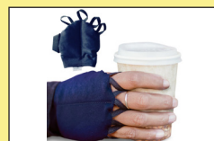
Handi Weight Weighted Glove TAS0902