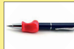
Weighted Pen TAS9345

Alerting These provide light touch sensations for alerting sensory input.